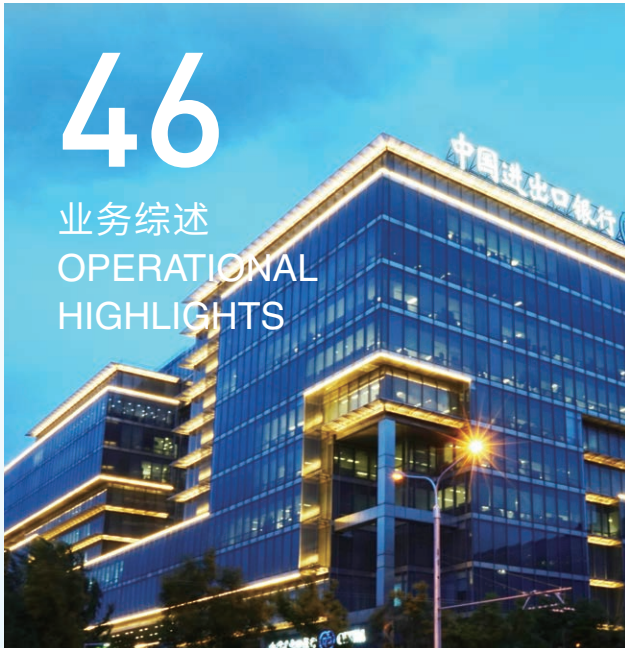
TABLE OF CONTENTS 目录